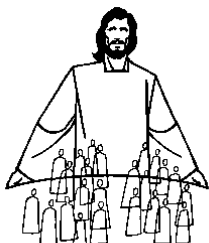
God has made him the head over all things for the church. Eph. 1:22

In the Old Testament, after the Babylonian exile (around 600 BC), no more kings sat on the throne of David. Prophets began to prophesy that God would send a king of the line of David, God's Anointed One . This is the promise of the Messiah . The word Messiah is Hebrew for Anointed One . In Greek, the word is translated Christos . So, when you say that Jesus is the Christ , you believe that He is the Anointed King foretold in the Old Testament.