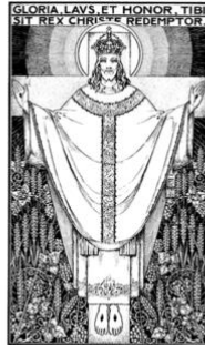
GLORIA LAUS ET HONOR TIBI SIT REX CHRISTE REDEMPTOR GLOBE, LORANGE, HONNEUR, AU CHRIST-ROI, RECOMPENSE GLOBE, PRINCE, AND HONOR TO THEE, O KING CHRIST, THE REDEEMER.

Dans l'Ancien Testament, après l'Exile en Babylone (vers 600 av JC), il n'y avait plus des rois assis sur le trône de David. Les Prophètes ont commencé à prédire que Dieu enverrait un roi de la lignée de David, le Oint de Dieu . Celle-ci est la promesse du Messie . La parole Messie est Hébreu pour l'Oint . En Grec, on transmet la parole par Christos . Ainsi, en disant que Jésus est le Christ , on professe qu'Il est le Roi sur qui reste l'Onction de